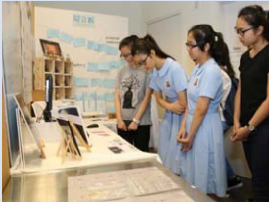
School of Design

25 Form 4 and Form 5 students were admitted to the PolyU Summer Programme 2016. The Programme provided a good chance for the participating students to learn more about the discipline itself through various hands-on activities conducted by academic staff of PolyU. Students also had an opportunity to visit the state-of-the-art facilities and talk to undergraduates about their study life at PolyU.