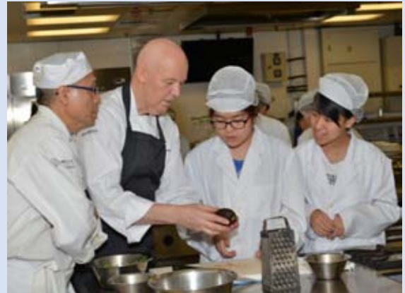
School of Hotel and Tourism Management