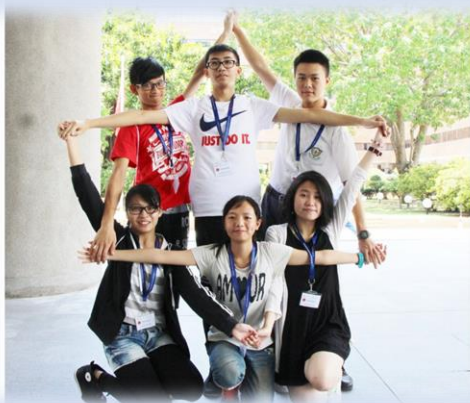
Department of Applied Mathematics