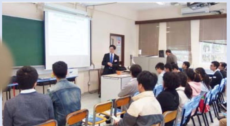
Seminar on undergraduate programmes, The Hong Kong Polytechnic University, March 2016