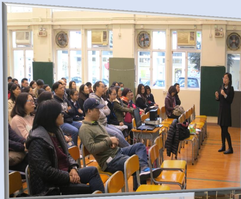
Seminars on Career and Life Planning for parents Feb 2016