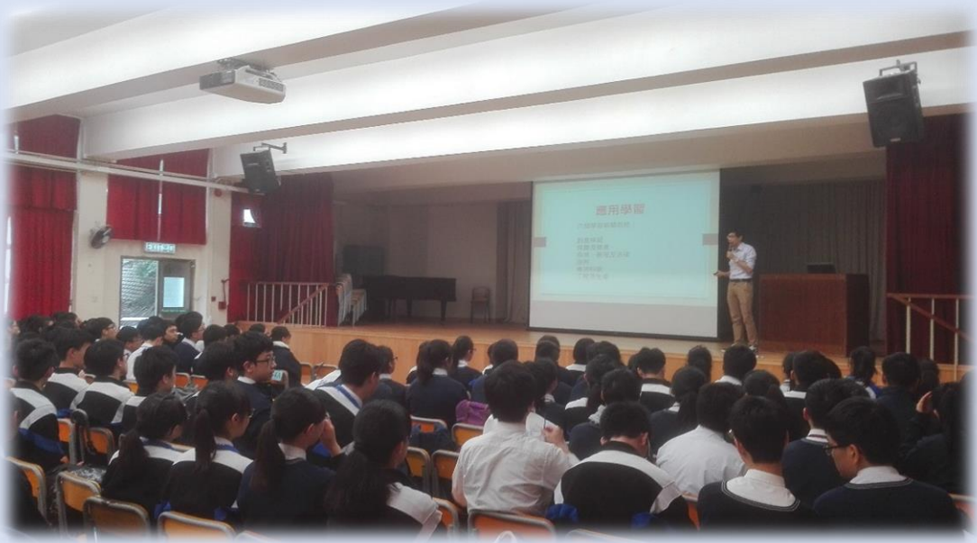
JUPAS Talk for S4 students, March 2016