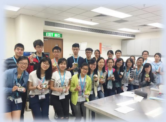
Department of Applied Biology and Chemical Technology