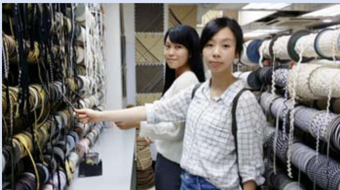
Institute of Textiles and Clothing