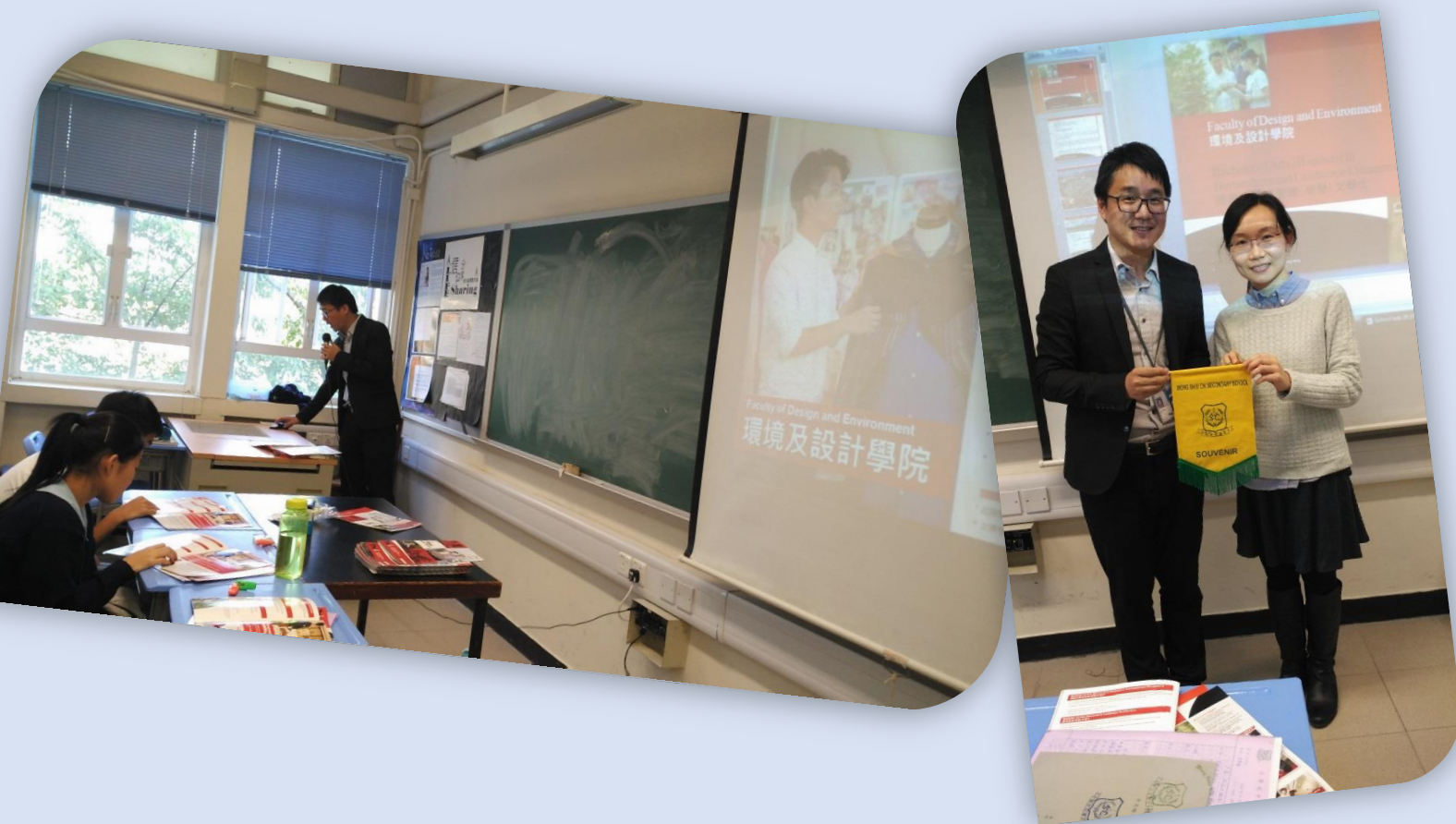
Admission talk by Technological and Higher Education Institute of Hong Kong (THEI), Nov 2015