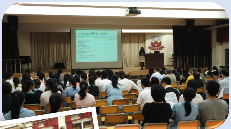
JUPAS Talk for S4-6 parents and students Nov 2015