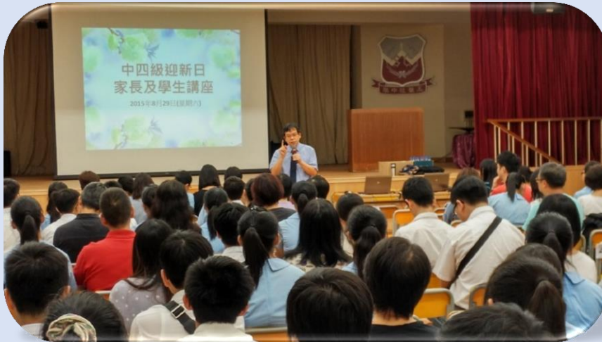
S4 Orientation Day Aug 2015

Various talks were organized to provide updated information about the entrance requirements of JUPAS-participating institutions, programme selection and non-JUPAS study options to senior secondary students and their parents. Besides, the Careers & Further Studies Committee and Academic Committee co-organized a talk to provide information of senior secondary curriculum to S3 students and their parents.