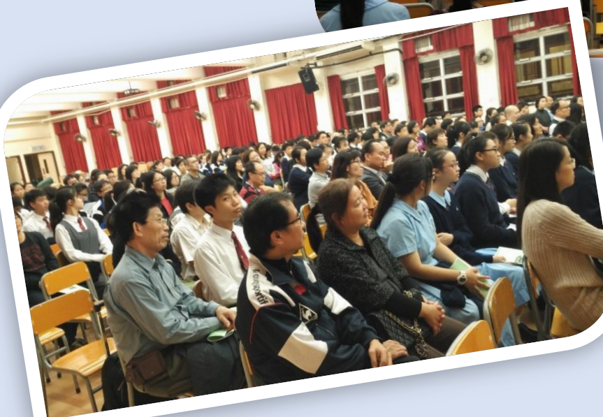
S3 Subject Selection Talk Dec 2015