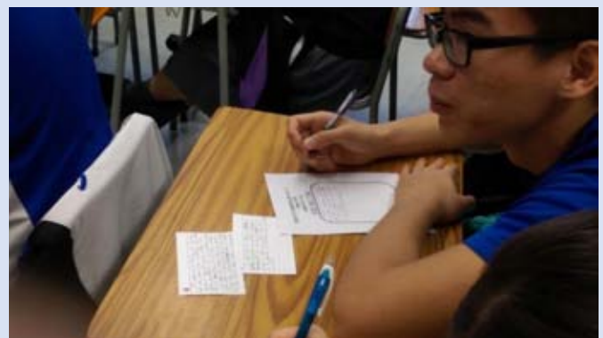
Interview skills workshop